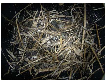
Fig. 6. Photo samples of rape straw using white light