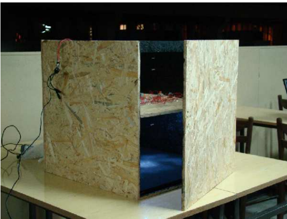
Fig. 1. Position of the measurements

Empirical data in the form of photos of compost, derived are designed specifically to the bench. Inbox cubic made of OSB panels measuring 50 x 50 x 50cm in the middle is painted in black. This causes the absorption of light that falls on the wall, which eliminates any light reflections.