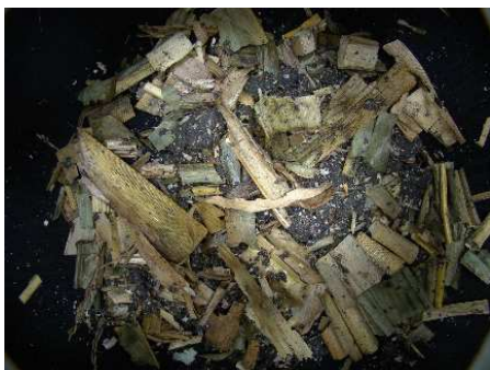
Fig. 4. Photo samples of maize straw using white light