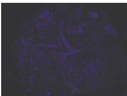
Fig. 5. Photo samples of maize straw using ultraviolet light-emitting diodes