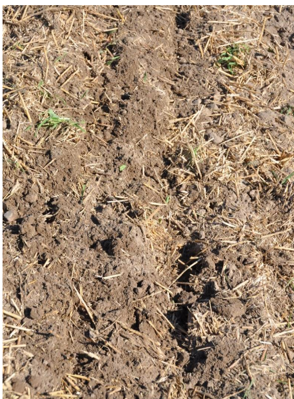
Trace of tine covered by discs