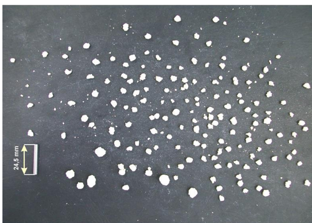
Fig. 5. View of pellets [8] Rys. 5. Widok granulatu [8]

The view of pellets for the parameters: \alpha = 30^\circ ; \chi = 60^\circ ; n = 21.6 rpm, w = 0.252 ; t = 8 min: R_g = 23.4 N, P = 92.2\% , P_{dx} = 94\% is shown in fig. 5.