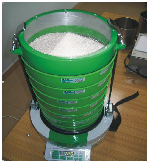
Fig. 3. Device for testing kinetic strength of pellets with the use of bearing balls [8]

A representative sample with a mass of 50 g was placed on a perforated sieve with an opening diameter of 0.5 mm, with 70 bearing balls with a diameter of 10 mm. The sieve, along with the tested pellets and the balls, was subjected to shaking on a mechanical shaker (Multiserw Morek, LpzE-2e type) for a time of 10 min. After the test was completed, an analysis of changes of proportional mass contents of a size fraction was performed and coefficient P_{dx} was established. For the purpose of the assessment, the ratio between the increment of the proportional content of the size fraction of 0-0.5 mm (pulp) to the initial mass (50 g) was adopted. For the purpose of the tests, a mixture of materials was used, produced and prepared in a production plant of a Polish producer of agrochemicals for agriculture and horticulture, Intermag from Olkusz [4].