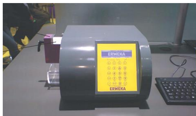
Fig. 1. Stand for testing the average compressive strength of pellets [8]

Compressive strength of pellets R_g is determined with the use of Erwek's TBH 200 D device (fig. 1), which measures the force needed for their crumbling. The tests were performed according to the methodology presented in publication [16].