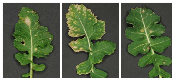
Fig. 1. Rape leaves infected with diseases, from the left: Verticillium fungicola , Botrytis cinerea Pers, Alternaria brassicae [10]

The GLCM matrix is used for texture analysis. Calculation of the GLCM matrix, and their calculated coefficients, were used by Harlick in his work.